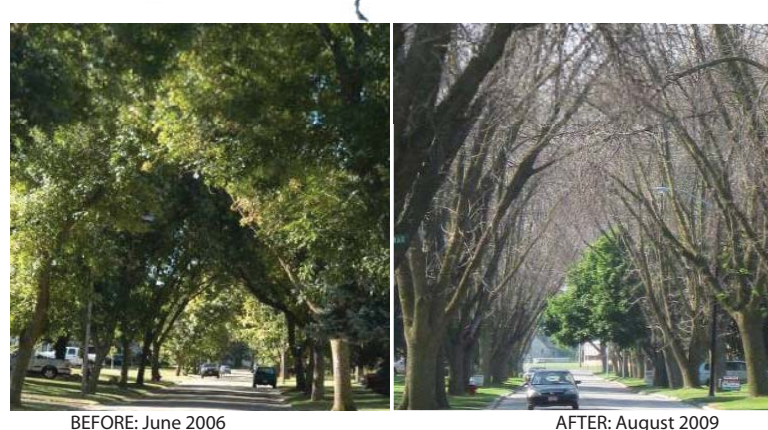
Toledo street before and after EAB